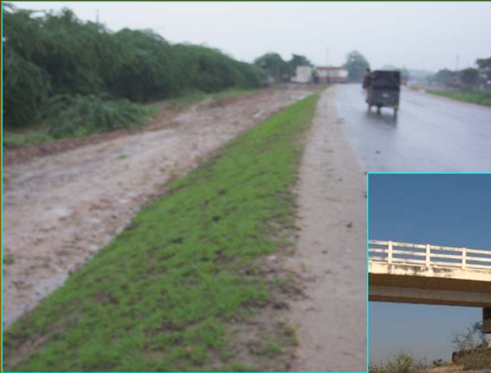
Sodding for Slope Protection