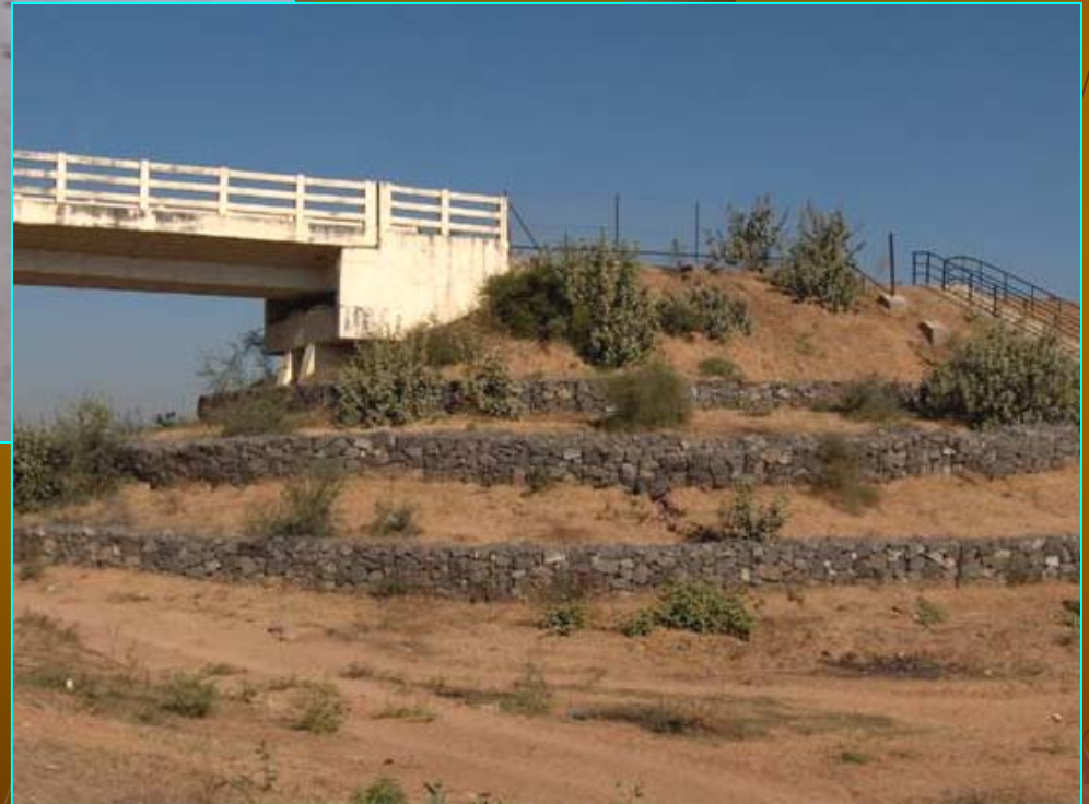
Benching, Stone Pitching for Slope Protection