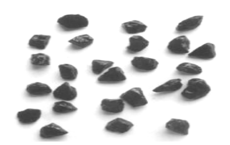
Aggregates kept out side for observation of stripping of bitumen coating